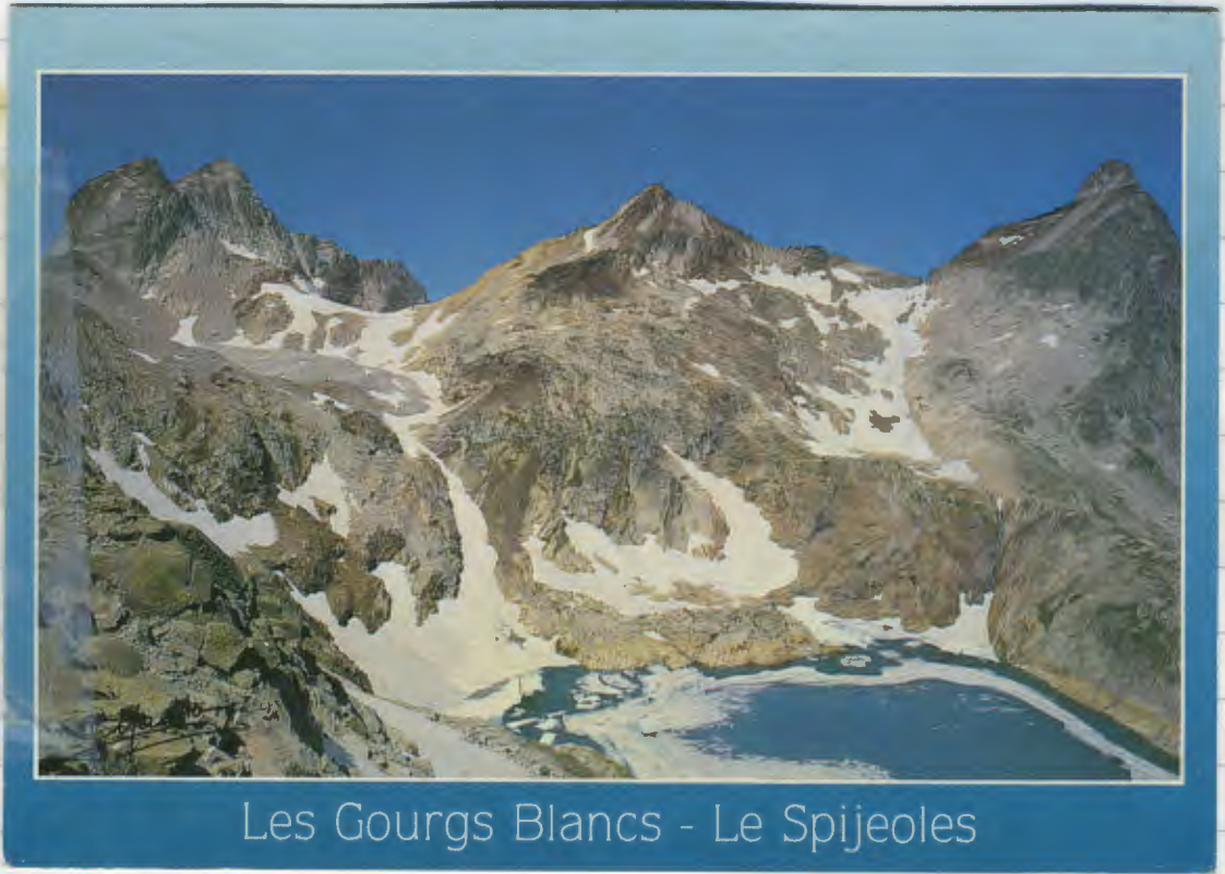
Les Gourgs Blancs - Le Spijeoles